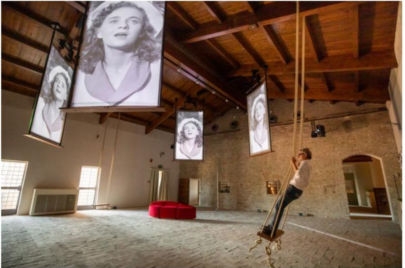
The Federico Fellini International Museum has debuted in the seaside city of Rimini, the hometown of the master Italian film director and screenwriter.