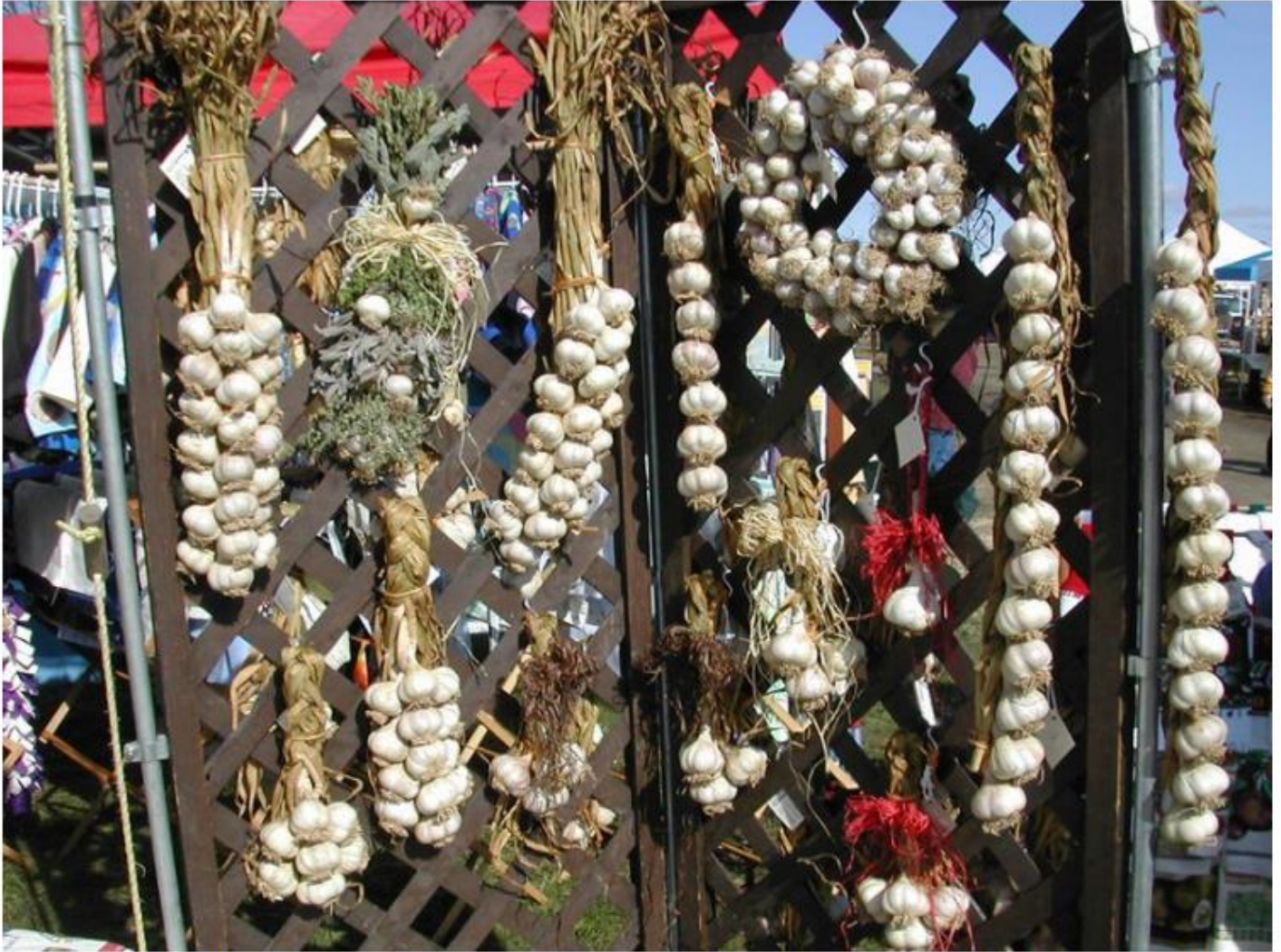
Mark your calendar for the 16th Annual Connecticut Garlic & Harvest Festival taking place at the Bethlehem Fairgrounds on Route 61 in Connecticut (Oct. 9-10).

experience. The package includes two-nights at either The Mansion or The Villages at Ocean Edge; a promo code to receive a pair of discounted Sperry boots; a cranberry-themed picnic experience by Ocean Spray; two tickets to a whale watching tour; and $100 credit toward cranberry spa treatments at The Beach House Spa. For an additional $15 per person, guests can tour a local organic cranberry farm. Available through Dec. 15. From $312 per night. 508-896-9000, www.oceanedge.com/specials/a-berry-sperry-fall