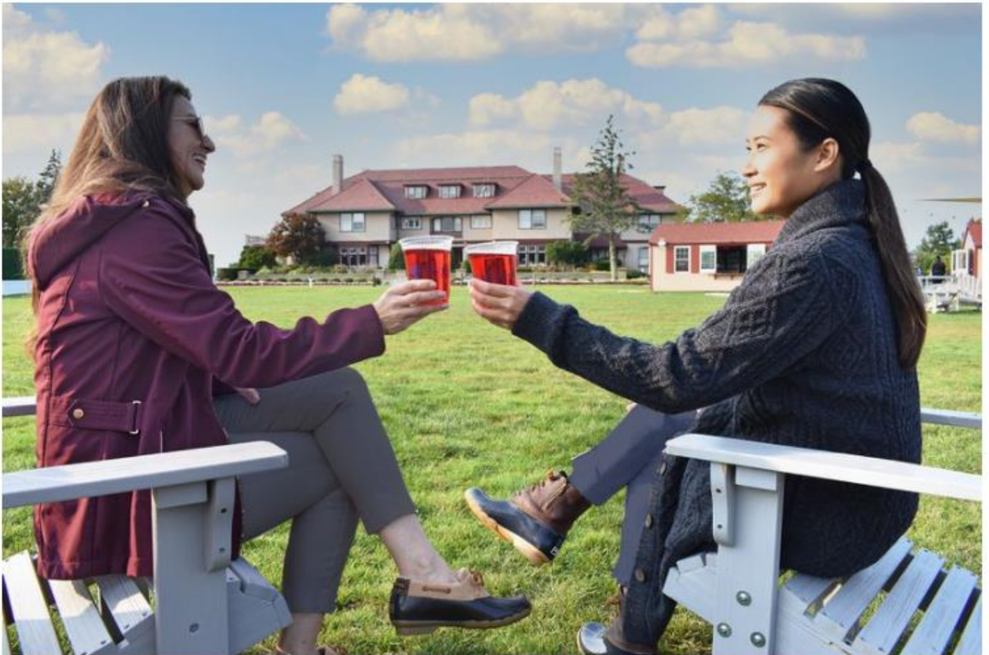
A Berry Sperry Fall at Ocean Edge package brings together Massachusetts-based brands Sperry, Ocean Spray, and the Ocean Edge Resort & Golf Club for a quintessential Cape Cod fall experience.