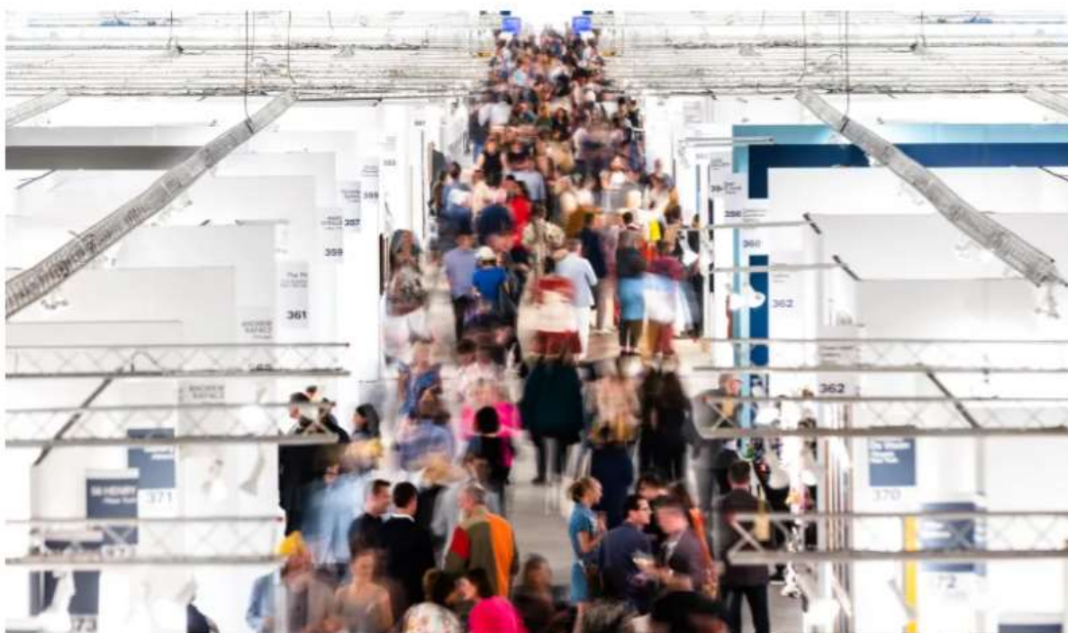
A view of last year's EXPO CHICAGO.

When I pitched my editor on sending me to EXPO CHICAGO I tried to hype it up for her by calling it “the fifth most important art fair in America.” It was kind of a joke, but in retrospect sounds even sillier. We’re not on the coasts; superlatives feel out of sync with the slower Midwestern way of life.