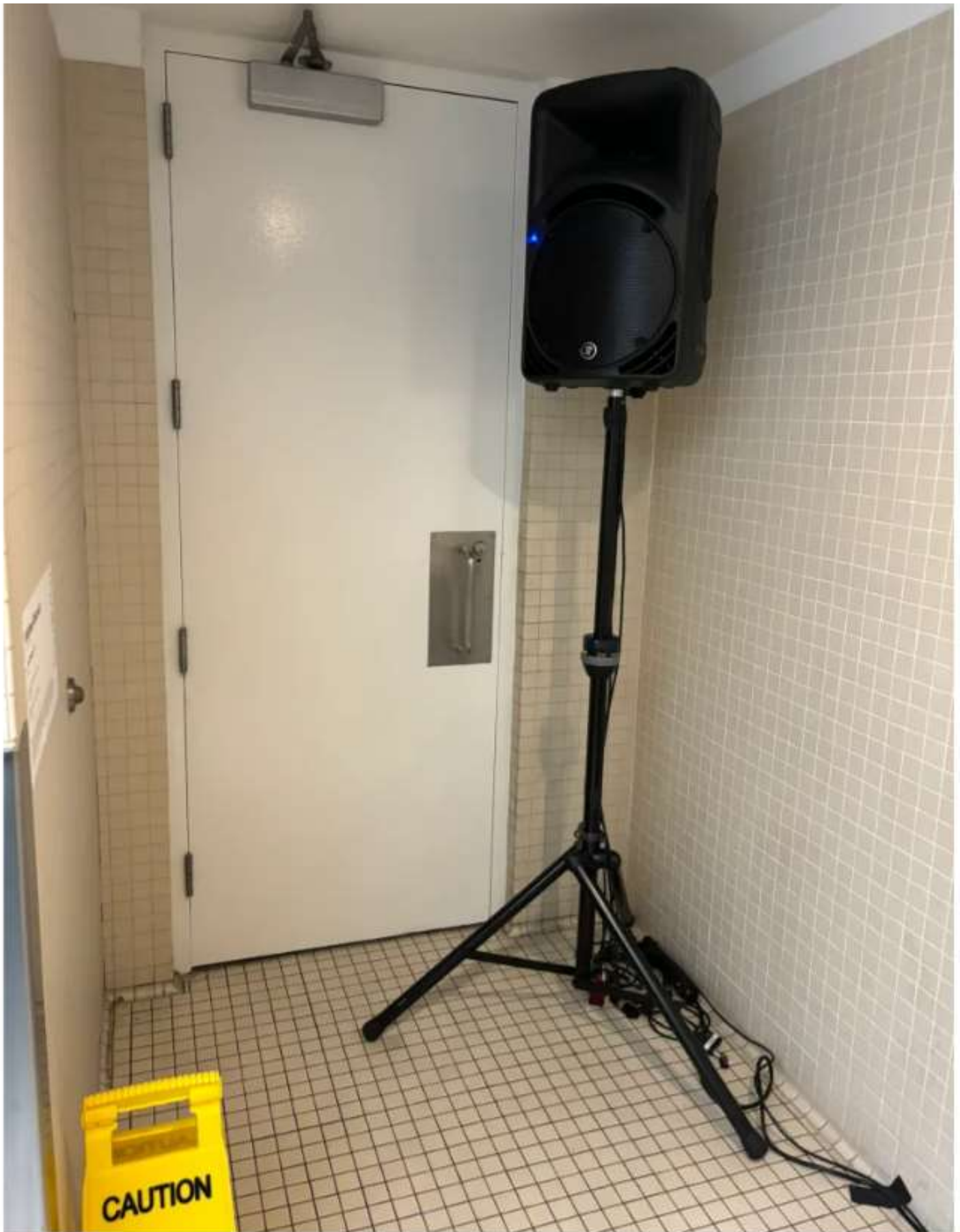
A speaker broadcasting Michael Rakowitz's 'The Breakup' (2010) in the CHICAGO EXPO men's room.